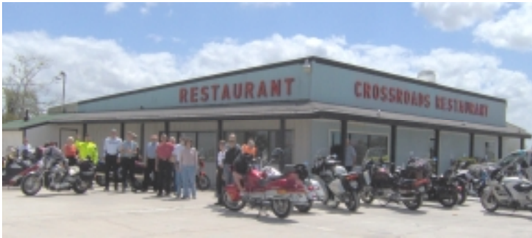
We sure took up most of the parking lot at the South Lunch ride to the Crossroads!

Now for the news - We had a nice turnout of 24 for the South lunch ride to the Crossroads restaurant in Okeechobee. That was a new destination for us on the north east corner of Okeechobee