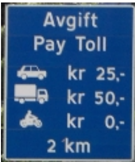
What a GREAT ideal NO toll for the M/C's