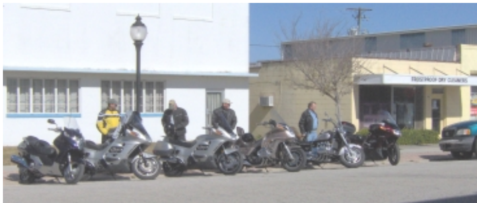
Preparing to depart for home from Jack's Diner in Frostproof