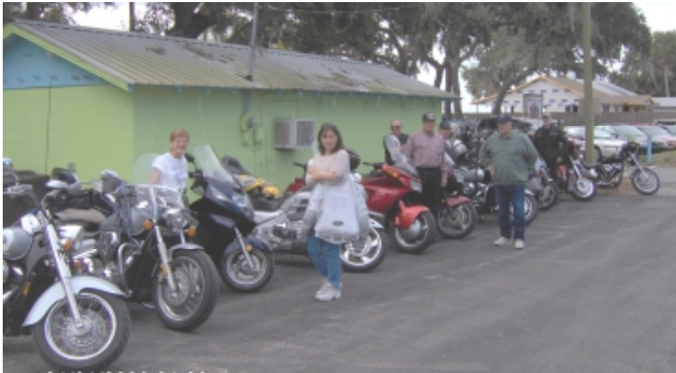
Time to head for Home from Gator Joe's in Ocklawaha