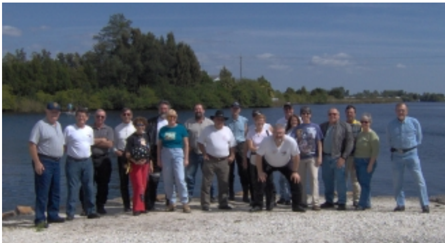
About half of the attendees of the South Lunch Ride, in front of the Myakka River in Venice, FL.

back so by the time we had the group photo, about half had left, but even at that you can see we had a great time.