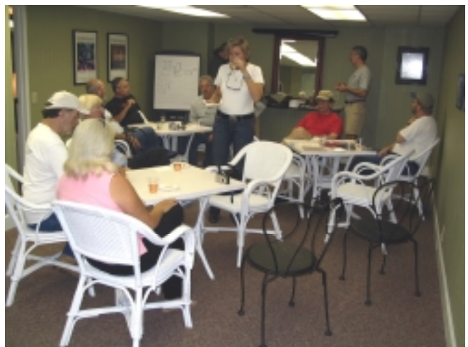
Casual atmosphere and great company made for an excellent social event.