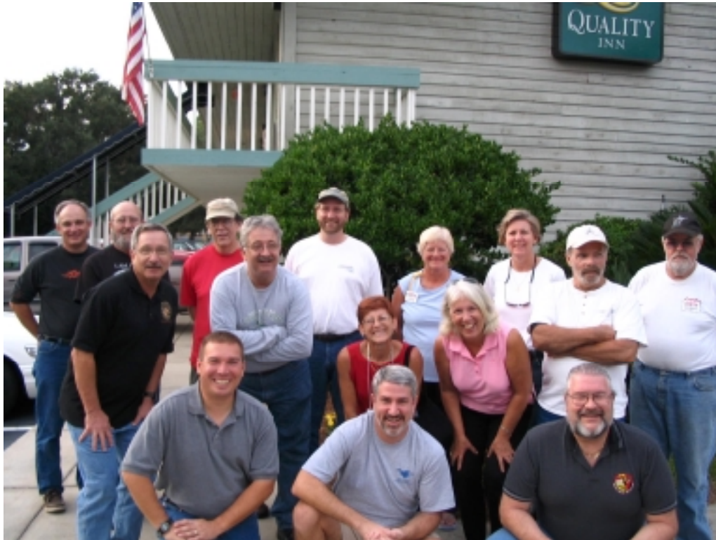
FL/GA Invitational Attendees (Left to right)