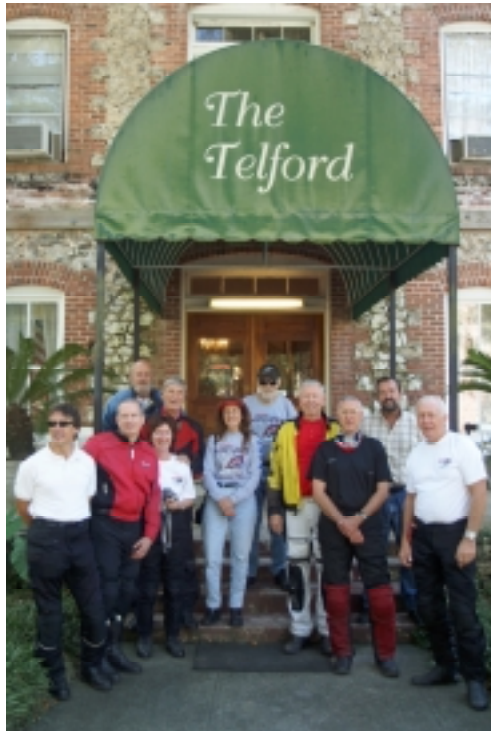
A very happy crew at lunch on the Fall Fantastic

Because the next day, after the early-to-rise southern group went out and "eventually" located breakfast (!), I went back to the hotel to catch up with the not-quite-as-early-to-rise rest of the group, gassed up and man, ... then the fun really started. Again, with perfect weather, and great roads with beautiful scenery, Phil led about 10 of us through those areas of North Central Florida, with no map and no GPS (unless Carmel was telling him where to go!) like he