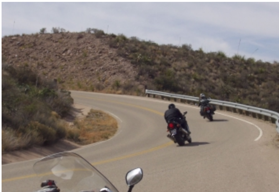
Carving the twisties - Texas style!

Davis to Terlingua offered some of the best riding in this part of the world. This route offers scenery that is so spectacular you have to experience it, and the high desert is the only place to find it. Friday night was registration and barbeque with a whole lot of tire kicking. Saturday morning broke clear and cool. Some of the crew went out dual sport riding while the rest did their best to leave as much rubber on the local roads as possible. I went into Big Bend National Park and spent most of the day just wandering around and talking to folks. Eventually I made my way to the banks of the "mighty" Rio Grande, about 6-8" deep and all of 15 feet across at this spot. There are so many things in this (Continued on page 5)