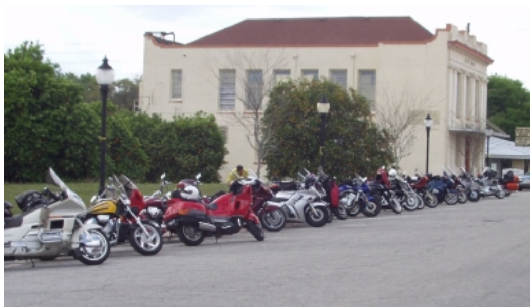
Some of the Lunch Ride "line-up" across the street from Jack's Diner

For the one lunch ride we did have, I want first of all to say a HUGE Thank You to the 25 riders who attended along with their 4 pillion riders. What a great turnout! As usual, it was about a 50/50 mix of members to non-members, but I