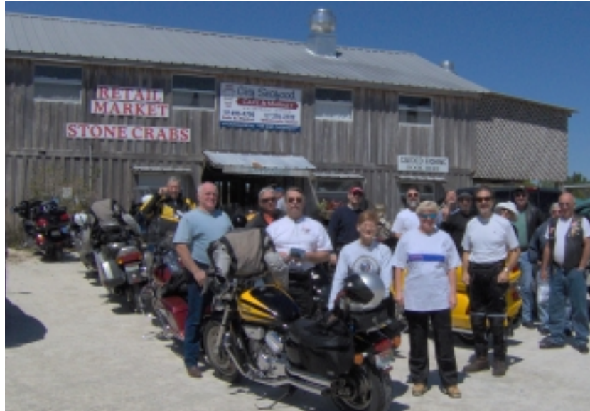
The obligatory "after lunch pose" at the South Lunch Ride in Everglades City

ride and especially the pace so that right there made my day! And, we still had lunch and the ride home to go.