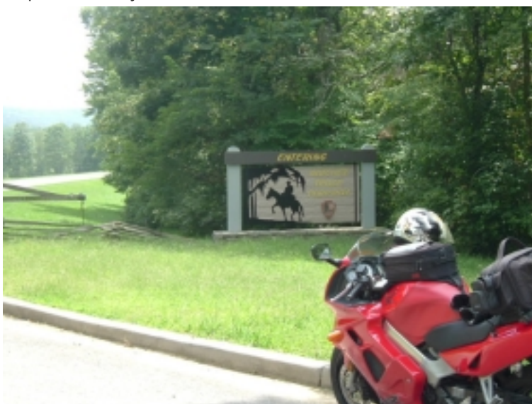
Entrance to the Natchez Trace