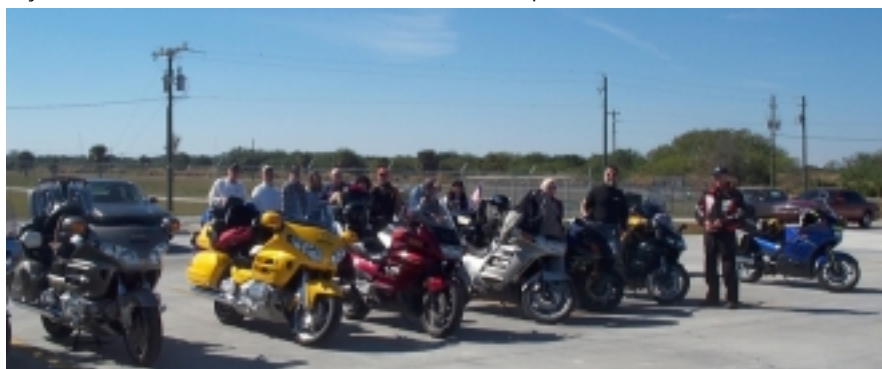
South Lunch Ride attendees (some were out of camera angle) MUCH nicer day!

stop in Zolfo Springs. Our new location, The Landing Strip, at the Okeechobee Airport turned out to be a great place. Though we filled it to capacity along with the regulars, they had ample servers in place and the service was excellent. Everyone got their