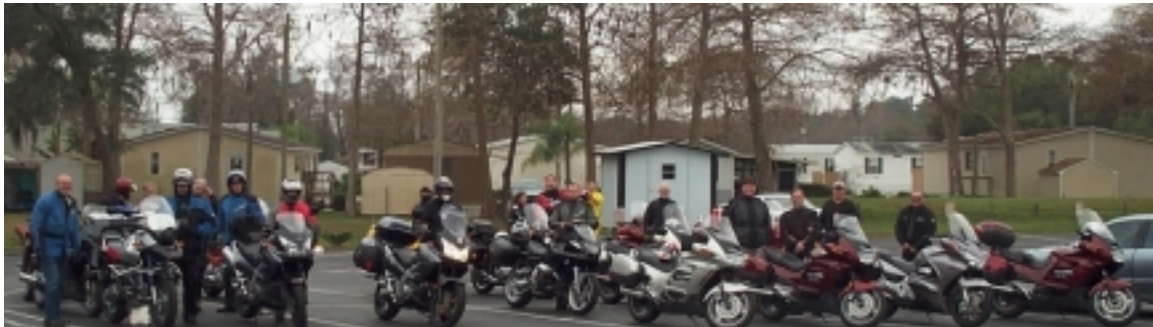
North Lunch Riders at the Blackwater Inn - Note the gray sky!

For the South Lunch Ride, temp's were predicted to be 45 ish or so, but it never got quite down there and it warmed up way quick in the morning sun. My group found us all peeling layers at our break