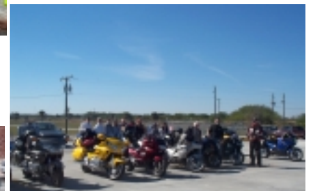
Nicer weather at the Jan 24 ride to Okeechobee!