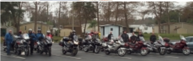
Jan 10 turnout to Astor