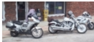
3 Silvers—ST, VROD & FJR at 3/20 ride to Frostproof