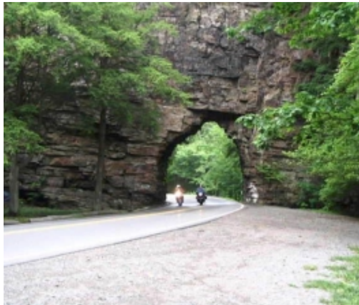
Backbone Rock Recreational Area

were on the open road. But it is also important even at low speeds.