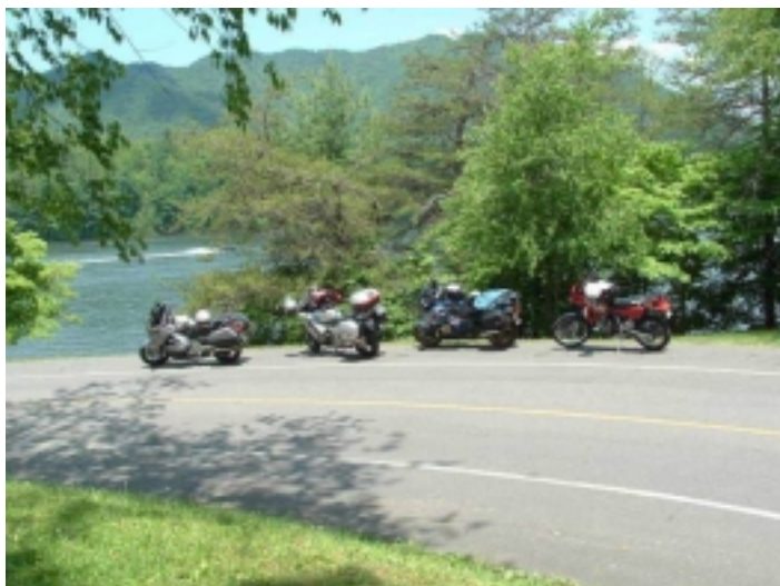
Lake Watauga Point Recreational Area