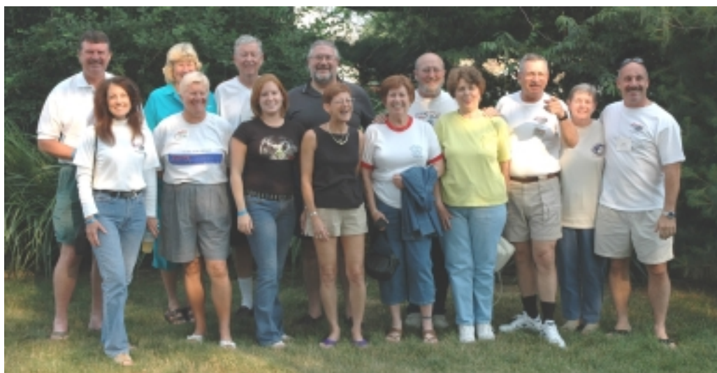
The Florida STAR05 attendees we were able to round up for the photo

As I hinted last month I am working on a new 'non-event'. It will be called "The Florida Georgia Invitational Lunch Dinner Brunch Ride". This will