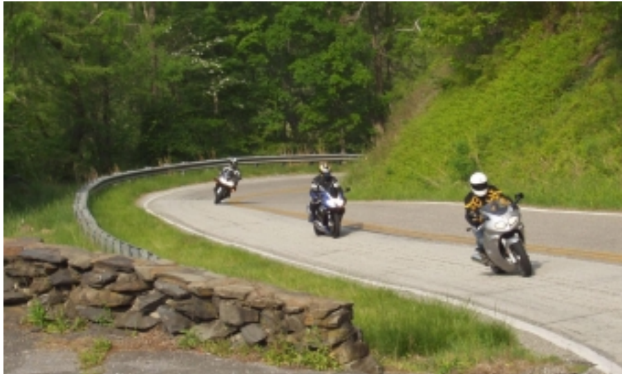
Deal's Gap—The kind of riding we'd all hoped for but didn't get due to the weather