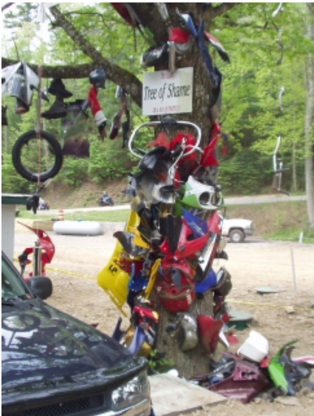
A reminder of those who have made a mistake on the Dragon