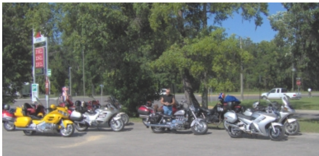
Fuel/Rest Stop in Brooksville for the South crew on it's way up the North lunch ride to Gator Joe's 3 Silver mounts and 2 of them '91 ST's!

four letter word - work - but I am going to definitely make our annual flagship event STAR later this month, and from that I'll manage to sneak in an STOC (ST Owners club) event in NC called EaSTOC. Even if you can't make any of those, there's still two more HSTA events in August and