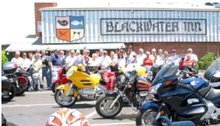
A pretty good size and definitely happy crowd after lunch!

Oh, you just gotta love Florida! We had two lunch rides on back to back weekends this month and both had outstanding turnouts. For the "South" ride to the Landing Strip Café at Okeechobee airport, I led a group of 12 bikes from Sun City Center, picking up another three along the way. When we arrived at the destination, there were another several riders dismounting for a total of 29 bikes. We just about busted the seams of the place, but everyone got fed and watered and eventually back on their way home. My group mostly went back the way they came, but myself and a few other adventurous riders scouted out some new potential destinations and covered some 315 miles round trip. We scouted a place called Light-