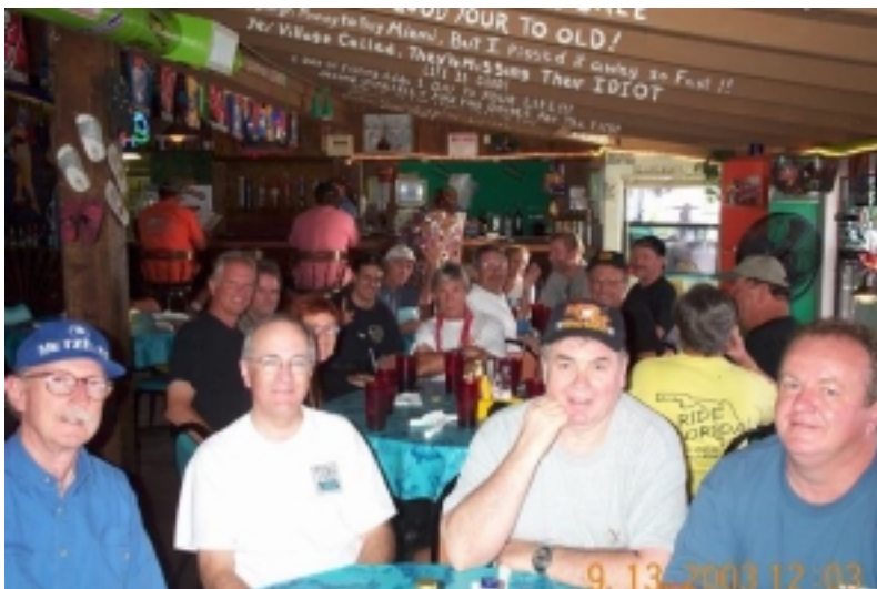
Lunch Ride Attendees at Gator Joe's in Oklawaha See the article for most of the names :-)