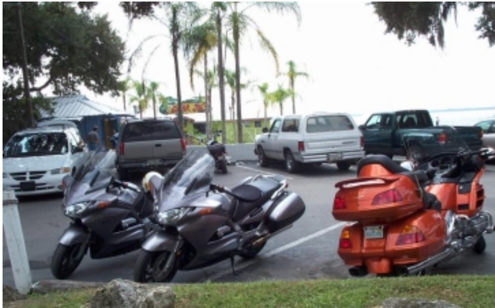
Sam Ulbing and his buddy's twin ST1300's along side new members Bob & Cheryl Fischer's Gold Wing

small, and we'd have been split up a bit if the usual 20 or more had shown. We eventually mounted up to make the trip home. Now the weather had been decent, if a tad warm and muggy, but as is usual for this time of the year, afternoon storms were in the forecast. We headed out north on US17, planning to make a gas stop at SR 66 just south of Sebring and then heading west on 66 from there. But as soon as we turned north on 17 I was wary. The sky ahead was black and the further we went, the blacker it got. We were still 5 miles from the gas station when I decided we were going to make a complete route change to try to avoid some of what was ahead. So, I lead an about face and we headed south on 17. Looking south and west, the skies looked MUCH more friendly and I was thinking we might actually make it home rain free. I know that's what I was thinking while some gassed up in