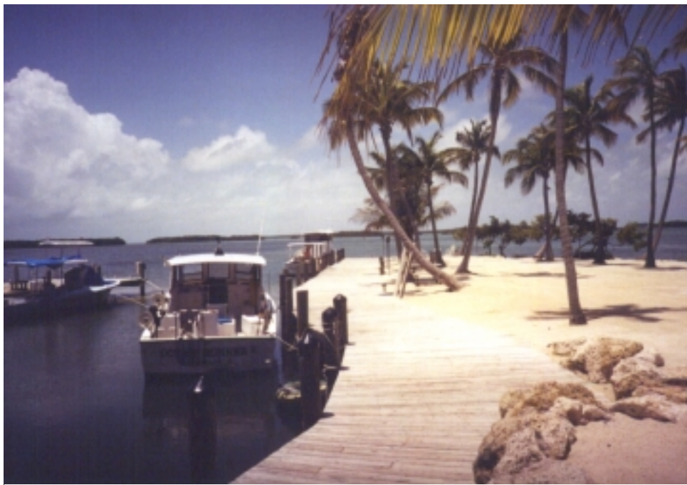
Lunch View in Islamorada