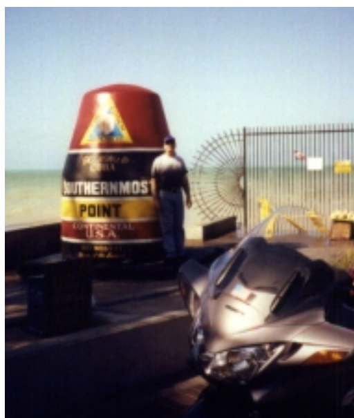
Larry Fitch, with Terry Brown's ST in foreground at the Southernmost Point

95 to Fort Pierce, where we exited and headed east on Route 70 to Okeechobee. For me, this was one of the best parts of the whole ride. The sun was rising behind us as we headed into the interior of Florida. Living on the coast as I do, I am always amazed at how different the